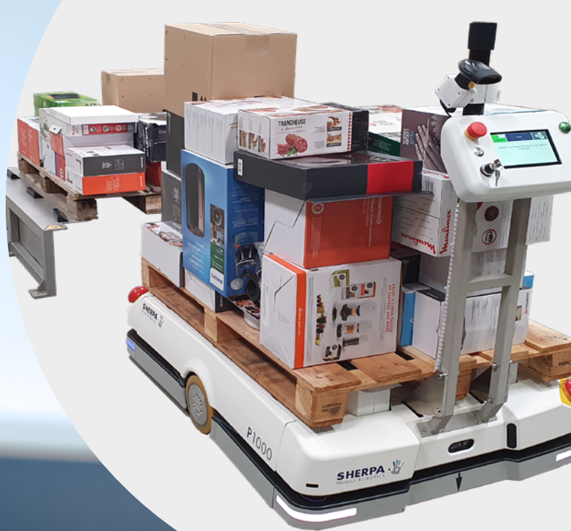
Pallet management solution (consult us)